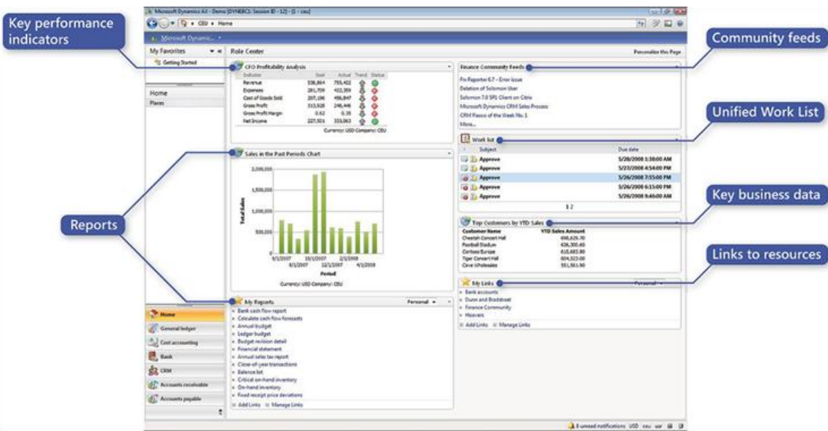
The Accounts Payable Coordinator Role Center: including current activity status, schedule, KPI data, and alerts.